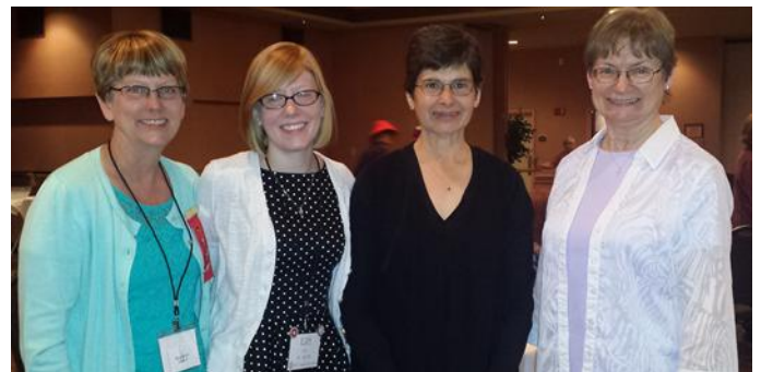
Big smiles must mean that they are having a great time at Convention!