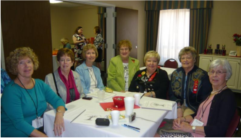
AB members enjoy a break during Convention.